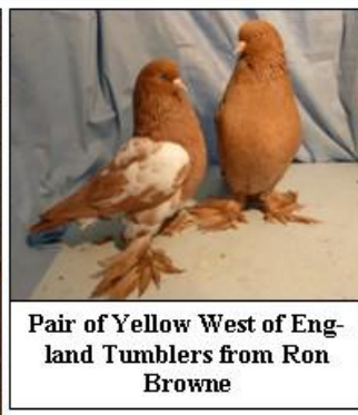
Pair of Yellow West of England Tumblers from Ron Browne