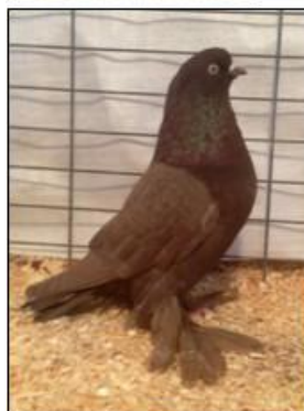
Pair of 2013 Brown West of England Tumblers from Max Moar