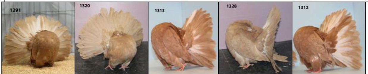
There will be 3 pairs of 2013 yellow Fantails from Master Breeder Brian Pogue. This is the leading stud of Yellows of today. L-R. Y.H 1291, Y.H. 1320, Y.H. 1313, Y.C. 1328, Y.C. 1312 and one young cock not yet pictured.